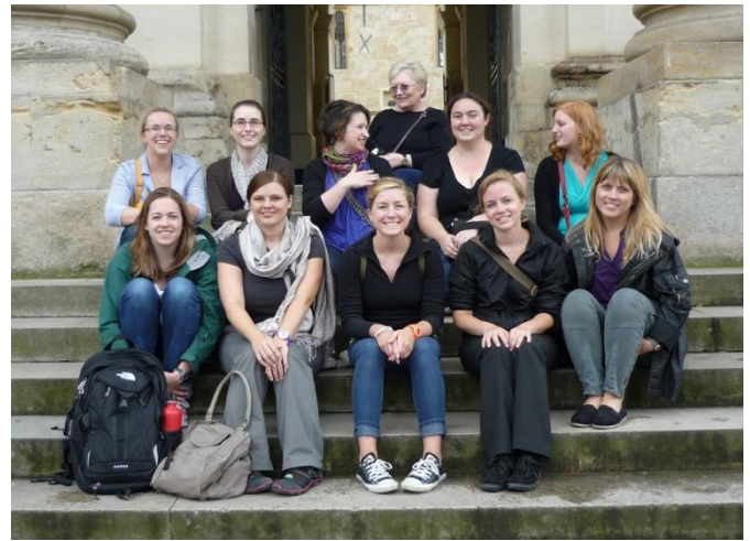
On the steps of the University of Oxford Bodleian Library, which claims to be the oldest English-speaking library in the world