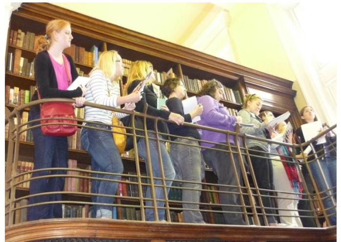
Taking notes at the Central Library in Edinburgh (a Carnegie public library)