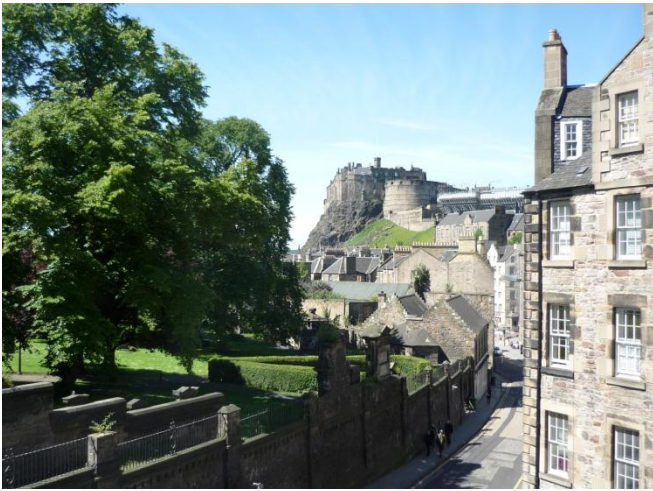
View of Edinburgh Castle from the back window of the Elephant House Coffee Shop, Edinburgh