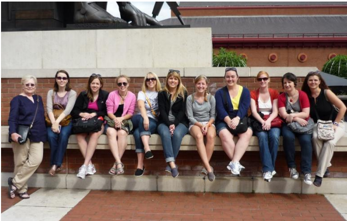
British Studies Class in the British Library Courtyard