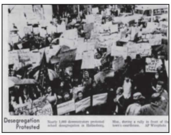
Sacramento Bee, January 6, 1970, 21.

Control of Education (CLCE) rapidly emerged to oppose reorganizing the Forrest County schools. Resistance was strongest among families of fifth through seventh grade children who were to be bussed from their local school in Petal to Earl Travillion in the Palmers Crossing community