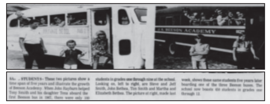
Hattiesburg American, May 24, 1972, 28.

Beeson's population jumped from 245 to 460 students in grades 1-12, primarily in response to integration within the Hattiesburg high schools. This increase was in line with national data showing a "racial tipping point" when local schools reached 25 to 35 percent minority population. He majority of new students came from the upper grades in the relatively wealthier area of Hattiesburg immediately south of USM, which had been redistricted to Blair in 1970-71. Beeson grew to a staff of twenty-seven teachers, as well as an elementary supervisor, guidance