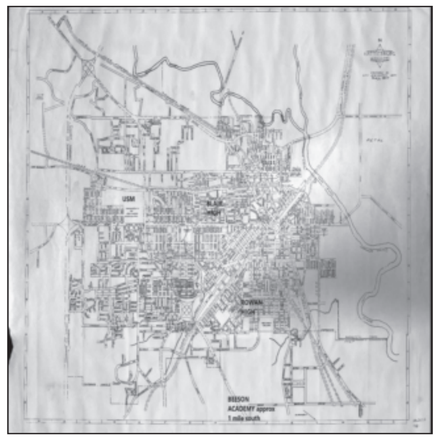
Hattiesburg map, City Engineering Dept, 1977 (USM Special Collections, Mississippiana Map Collection)

Several black members of the Hattiesburg district's biracial committee subsequently requested modification of the plan to integrate all schools. While the adopted revision kept elementary schools racially distinct, in the fall of 1971 both eleventh and twelfth grades were consolidated into Blair and all tenth graders placed at Rowan. Both high schools would then be comprised of grades consistent with the system-wide racial breakdown. The overall racial makeup of students in the Hattiesburg school district flipped from 55 percent white and 45