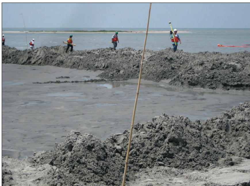
Figure 2. Building sand berms (with dredged sand) along the Louisiana coast.

barriers to close some inlets into Barataria Bay to prevent oil intrusion into the estuary. This permit request was denied (USACE 2010).