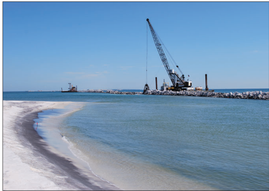
Figure 3. Crews blockade the inlet with riprap at Katrina Cut on Dauphin Island, Alabama. This view is from the uninhabited west end of the island, looking across the inlet toward the heavily developed east end.

routes are possible whenever local hydrology is manipulated (Chaibi and Sedrati 2009). The reduction of inlet volume decreases the exchange of water and sediments during tides (Kraus and Militello 1999). This, in turn, affects flow velocities, typically resulting in scouring along bank margins, while near-shore wave dynamics often change as well (Komar 1996). The closing of inlets can modify the salinity, oxygen level, and turbidity of back bays. Associated ecosystems often experience large fish kills or other radical shifts toward new ecological states, as physical and chemical parameters adjust to a decrease in mixing throughout the water column (Goodwin 1996). If inlet restriction is absolutely necessary, it should aim to minimize the impacts on local hydrology and ecosystem function.