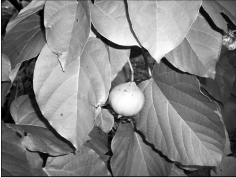
Figure 4. Tung nut still encased in a rind.

The State Highway Department, according to the Jackson Daily News , described the tung tree as “an ornamental because of its scenic beauty.” 64 The Clarion Ledger said tung orchards provided a “roadside panorama of beauty that fascinates Northern visitors.” 65 Tourists driving along Louisiana Highway 21 as well as U.S. 19 and U.S. 27 near Tallahassee, Florida, and Capps, Florida, gazed at a “veritable blanket of salmon pink petals.” 66 The Tung Trail, miles of trees along the road, stretched from Picayune to McNeill, Mississippi, along Highway 11, and another stretched from Picayune to Bogalusa, Louisiana. 67 Travelers to the coast multiplied in the post WWII years as middle class tourism expanded, but the Federal Highway Act of 1956 damaged roadside tourism. 68 After interstate highways developed,