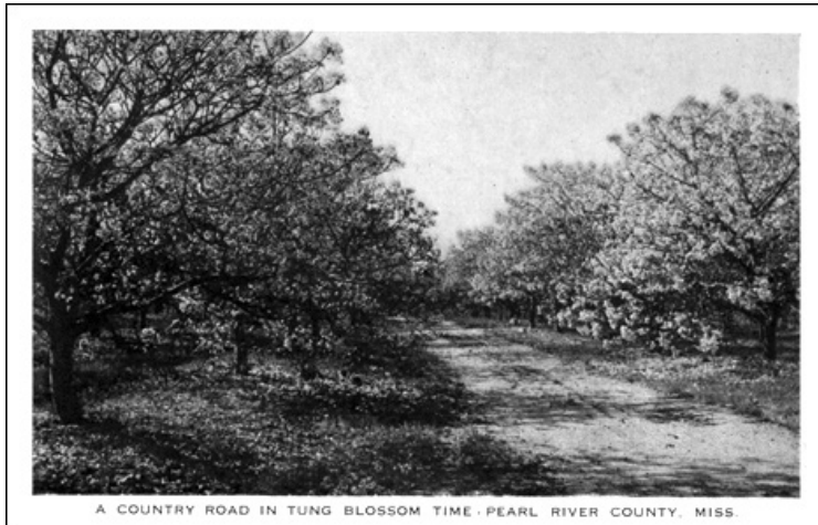
Figure 1. Postcard. Gulfport Printing Company.