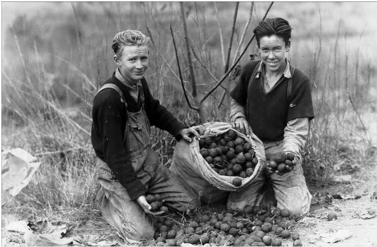
Figure 5. Tung nut pickers, February 28, 1940. Dixie Press Collection, Mississippi Gulf Coast Community College Archives. Courtesy of Mississippi Gulf Coast Community College Archives.

Northern visitor has learned this the hard way.” 81 Consuming tung nuts caused illness and swelling of the mouth and lips and possibly hypertension, delirium, convulsions, anaphylactic shock, and death. 82 Despite this, many individuals either disbelieved or dismissed the risk given the visual appeal of the large nut which strongly resembled a Brazil nut or a walnut. While the nut smelled strongly of kerosene or as one source claimed, ham fat, its appearance won out. 83 In one Louisiana Forestry Bulletin , an author noted that the very name “tung nut” beckoned onlookers to eat and that “there are still skeptical individuals who believe the warning not to consume is a trick to deprive them of something edible.” 84