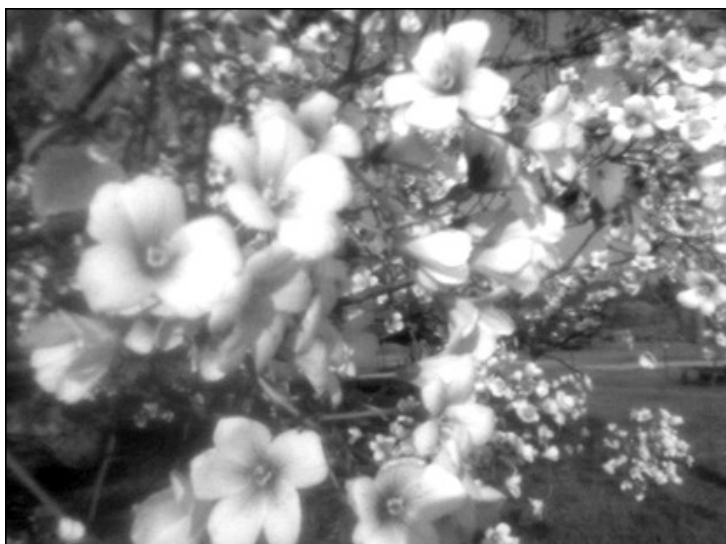
Figure 3. Tung blossoms.