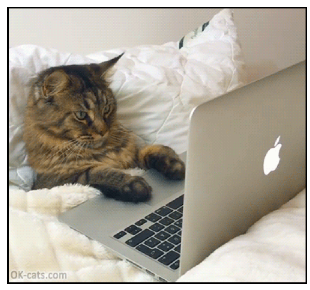
gratuitous cat picture