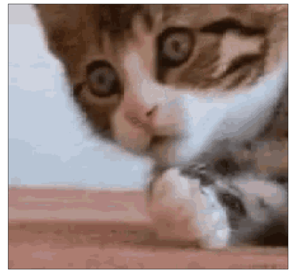
gratuitous cat picture