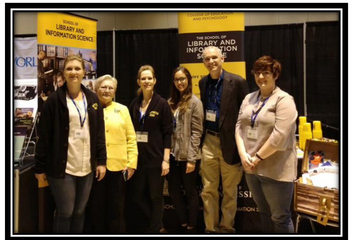
SLIS Faculty, Staff, GAs @MLA

Southeastern Library Association (SELA) Conference White Sulphur Springs, WV, Nov. 8-10