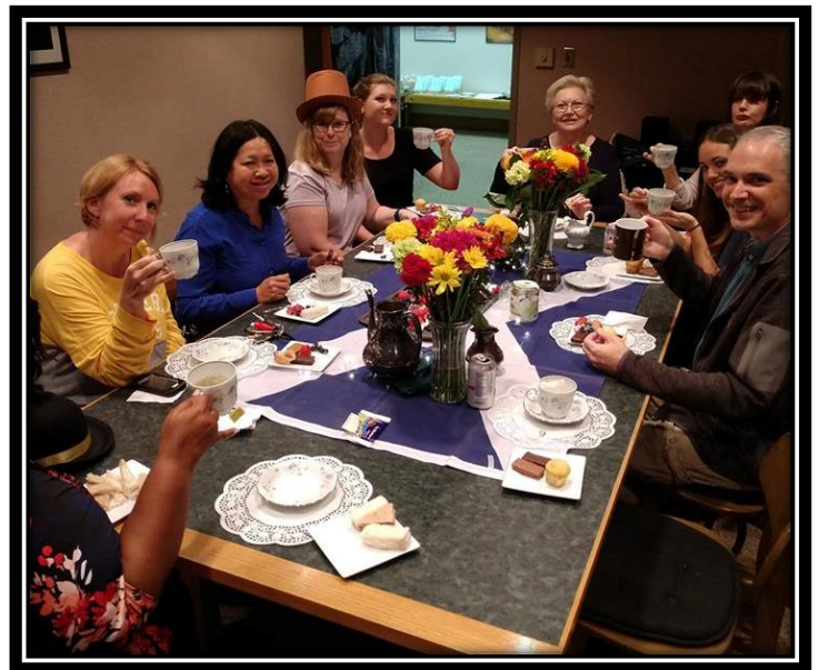
English High Tea, Bosses Day, SLIS, October 16 th

While we remember the many wonderful things that happened in fall/winter 2017, here’s to a great, productive spring 2018!