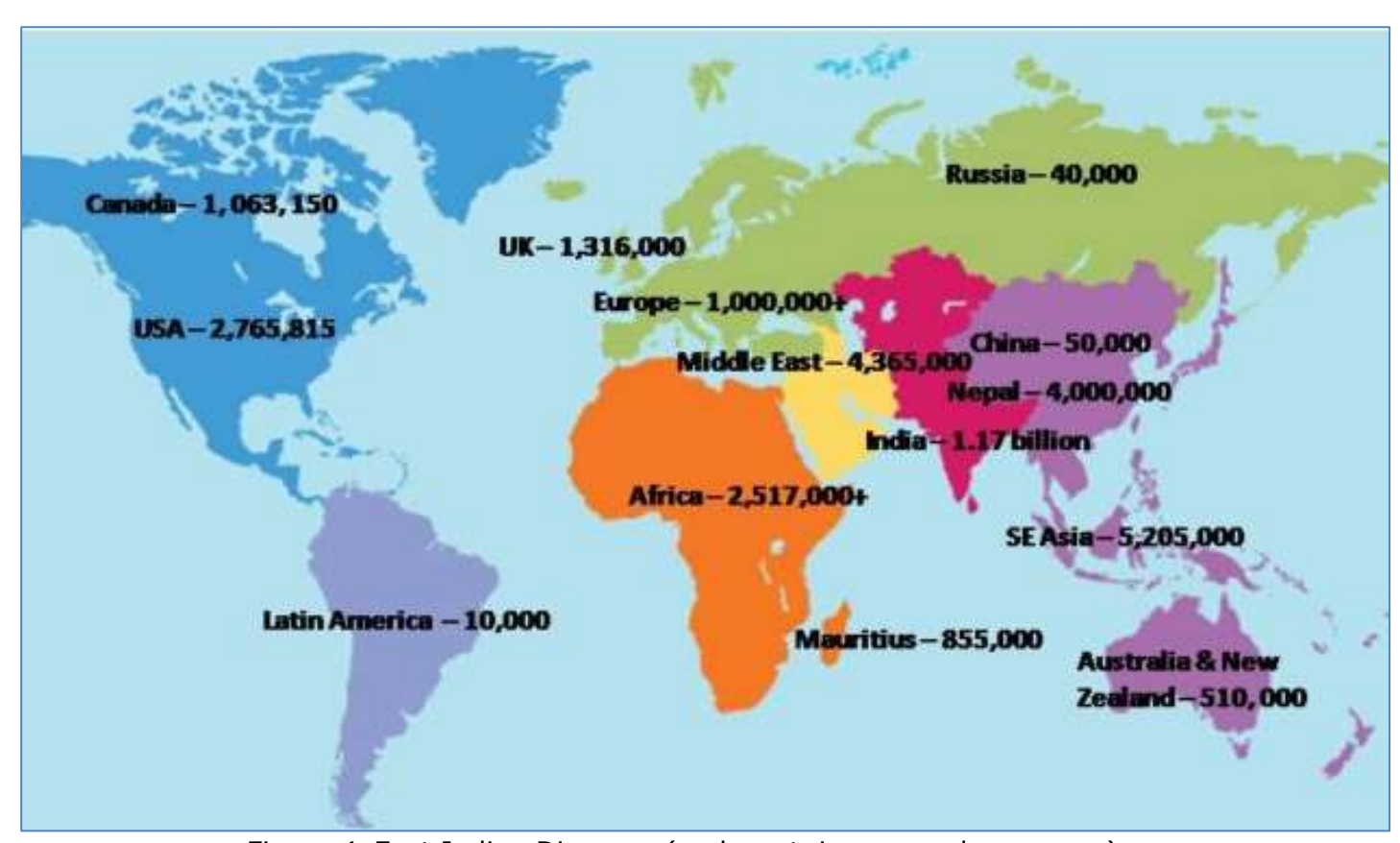
Figure 4. East Indian Diaspora (andrewstojanov.wordpress.com). https://www.newsgram.com/indian-arrival-day-remembering-the-hardships-of-indians-who-were-brought-as-indentured-labourers

Informative revelations that were gained through the substantial documentation of the EIC records at The British Library, the National Maritime Museum Library, Greenwich, and The National Archives at Kew. More research is needed on slaves and indentured laborers from the Indian Ocean area to the Americas such as detailed statistics on the volume of Indians who were brought to the Americas and the areas from which they were transported. As DNA analysis becomes more common, perhaps that will inspire more scholarship and awareness of the East India Company, Indian slave trade, and the Indian Ocean - Trans Atlantic connections.