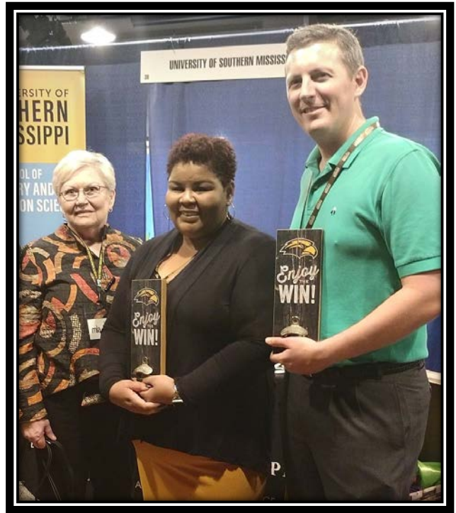
Mississippi Library Association Annual Conference Meridian Riley Center