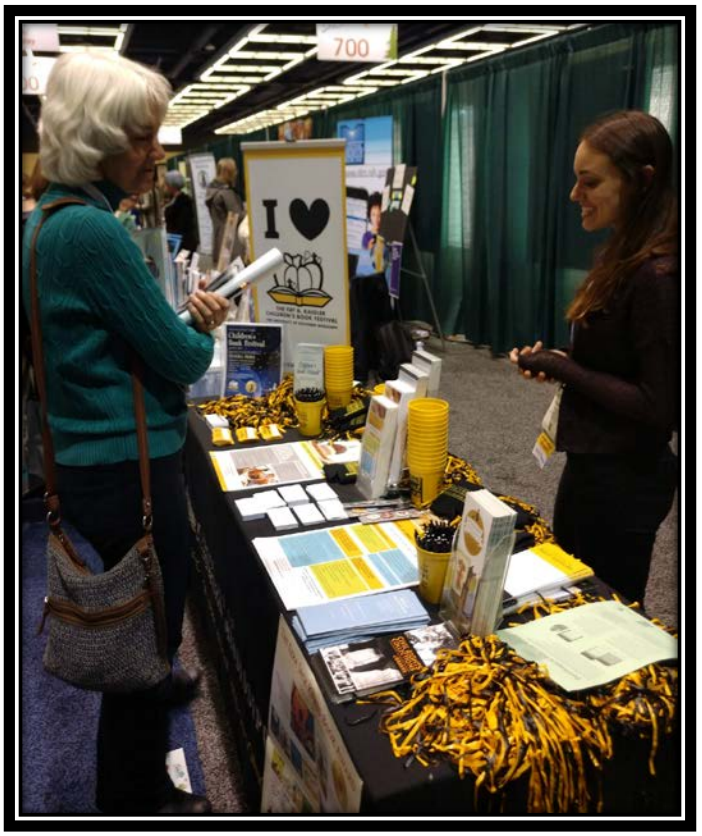
Scenes from ALA Mid-Winter 2019 Conference, Seattle