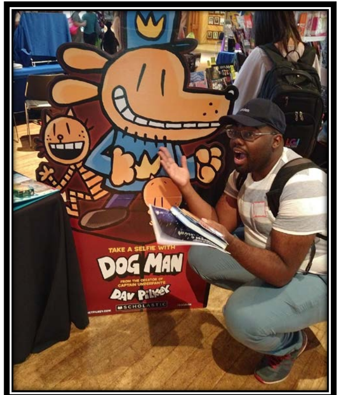
Library and Media Professionals (LAMP) September 9-12, Oxford, Pearl, Hattiesburg, and Long Beach