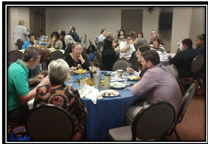
Mississippi Library Association Annual Conference SLIS Alumni Breakfast October 17, Meridian Riley Center