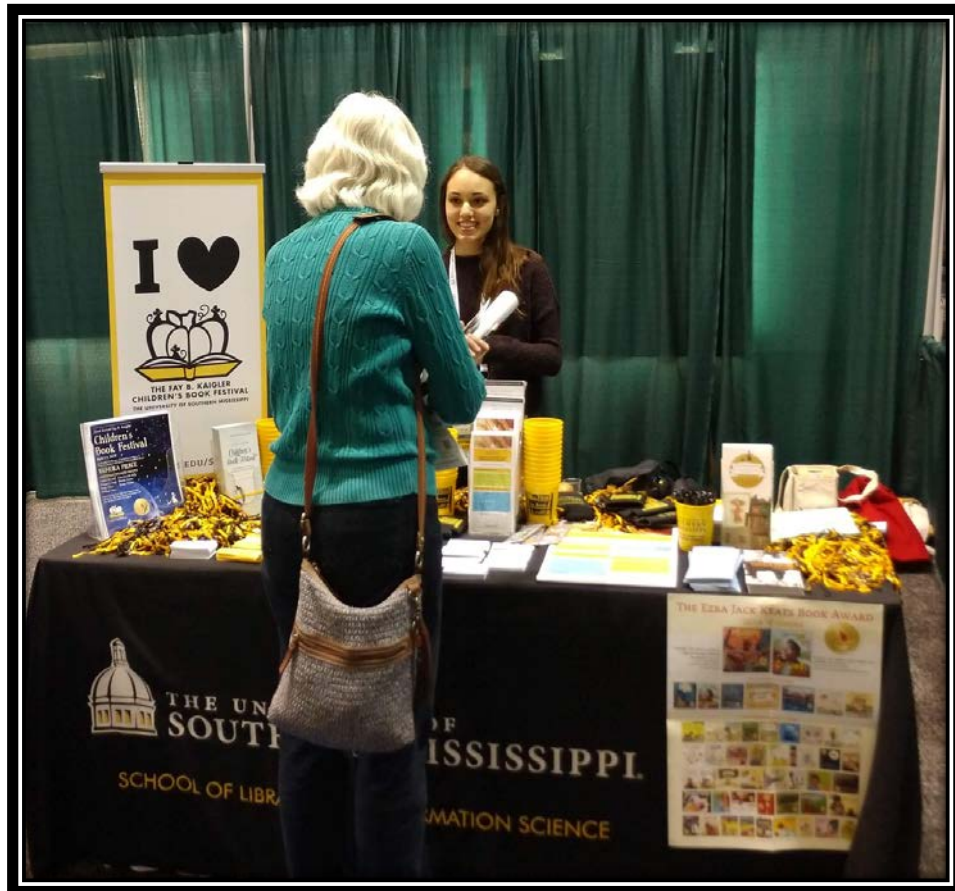
ALA Mid-Winter Conference, Seattle, January 25-29, 2019