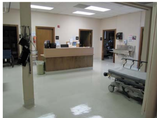
Figures 9 and 10: The recovery hub of the Pain Management Center on Asbury Circle

Unlike the examination rooms at the Lincoln Center location, the finishes in this office are old and outdated. The walls are a colder shade of white, and the combination of laminate countertops with the wooden cabinets is unpleasant. Though the natural light helps to bring in something warm and familiar from the outdoors, it is not enough to offset the poor furniture layout and the all too sterile environment.