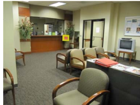
Figures 1 and 2: Images of waiting room at the Institute for Spinal Pain Treatment at Lincoln Center

In the recovery hub, located in the back of the office, patients are given a decent-sized space, separated by walls on three sides. The fourth side features a curtain for easy accessibility by the staff. The central work stations are located in such a way that attendants may observe each patient at all times.