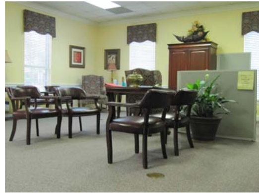
Figures 7 and 8: The waiting room of the Pain Management Center on Asbury Circle

In the back portion, where patients are placed before and after going into surgery, there is virtually no privacy. Unlike the first office, a flimsy curtain is the only material that separates each patient's bed from another.