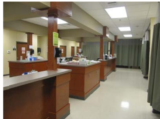
Figures 3 and 4: The recovery hub of the Institute for Spinal Pain Treatment at Lincoln Center