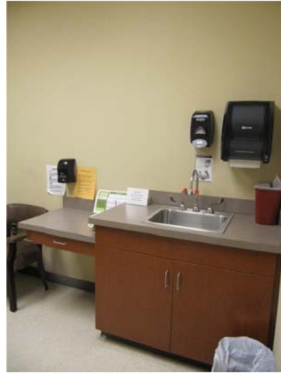
Figures 5 and 6: An examination room in the Institute for Spinal Pain Treatment at Lincoln Center

On the other hand, the older location on Asbury Circle, presented a very different interior. The finishes are outdated, and there is a harsh contrast between the paint color and the furnishings. Despite efforts to incorporate more “homey” elements in order to create a more comfortable atmosphere, these components do more harm than good. The fabric appears to be residential grade and not easily cleanable. Furthermore, the layout of the entire room is awkward and difficult to navigate, divided by old, gray cubicle walls.