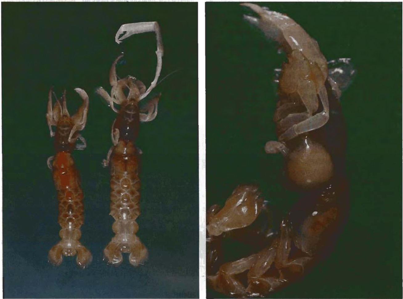
Figure 3. A, photograph of unparasitized male (left) and female (right) of Callichirus islagrande ; note orange ovavles seen through exoskeleton of the first two abdominal somites of the female. B, Pseudione overstreeti , new species, in right gill chamber of "female" C. islagrande .