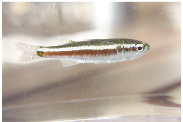
FIGURE 2. Prejuvenile Mountain Mullet, Agonostomus monticola , collected in the Nantes River, Montserrat on 8 January 2015. Specimen deposited in the New York State Museum (NYSM 71909). Size is about 31 mm SL.

showed one large anal spine, and lacked the black fin bars typical of Bobo Mullet (Greenfield and Thomerson 1997). A visually striking red band evident on these individuals (Figure 2) is a very unusual character for mugilids and has been briefly mentioned by Robins et al. (1986). The resulting COI sequence from the Montserrat mullet was identical to