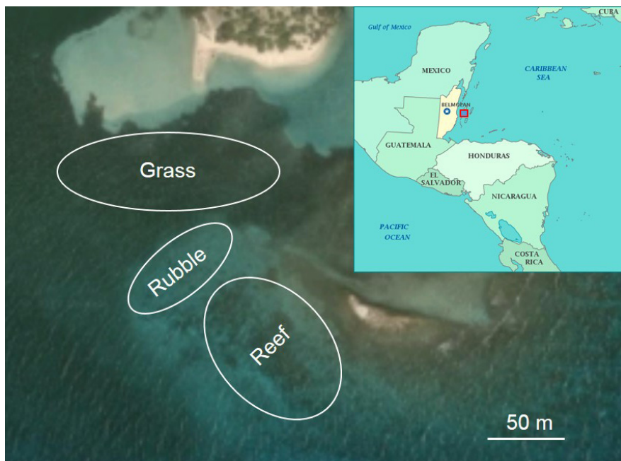
FIGURE 1. Geographic and habitat sampling locations in Belize, Central America (map inset modified from Online Atlas and habitat image modified from Google Earth).

To explore how syllid display densities vary over different habitat substrates, we first summed the number of displays recorded over each habitat during the entire observational period (18:30–19:30); this was done independently for each of the 3 nights. We calculated