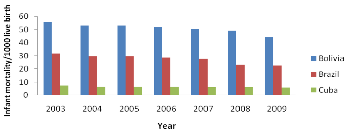
Figure 2. Comparison of infant mortality rates in Bolivia, Brazil and Cuba, 2003–2009.

Infant Mortality Rate (IMR) : LAC has been able to maintain a steady decrease of IMR of 4% over a decade since 1990 [10]. Vaccination programs, better access to drinking water, and lower cost for primary care are amongst the principal contributors to decrease IMR [55]. Among the most successful health reforms targeting infants and mothers are the ones implemented by the Brazilian government with a continuity care for women and children; Bolivia's national health insurance initiatives for women and children; and Ecuador's free maternity program [56]. Brazil, Chile, Ecuador, Paraguay and Peru offer midwife programs with university certification, and nursing training [56]. Brazil is on track at reducing IMR by 9.16 points from a rate of 31.74 per 1,000 live births in 2003 to 22.58 per 1,000 live births in 2009 (Figure 2), while Bolivia's IMR is still high and not on track. Cuba stands as the first LAC country that has already fulfilled the MDG by reducing its IMR to 5.82 per 1,000 live births, the lowest rate in the region [55] (Figure 2).