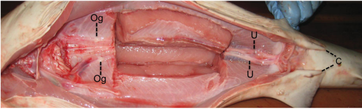
FIGURE 1. Body cavity of the basic intersexual Blacktip Shark from Mississippi waters. Although a vertebral sample was removed prior to taking the photo, the immature female reproductive tract, including oviducal glands (Og) and uteri (U), as well as immature claspers (C) are apparent.

1996) being present, indicating a maturing testis (Figure 2B). As this specimen did not have gonadal tissue from both sexes, it was considered a basic intersexual.