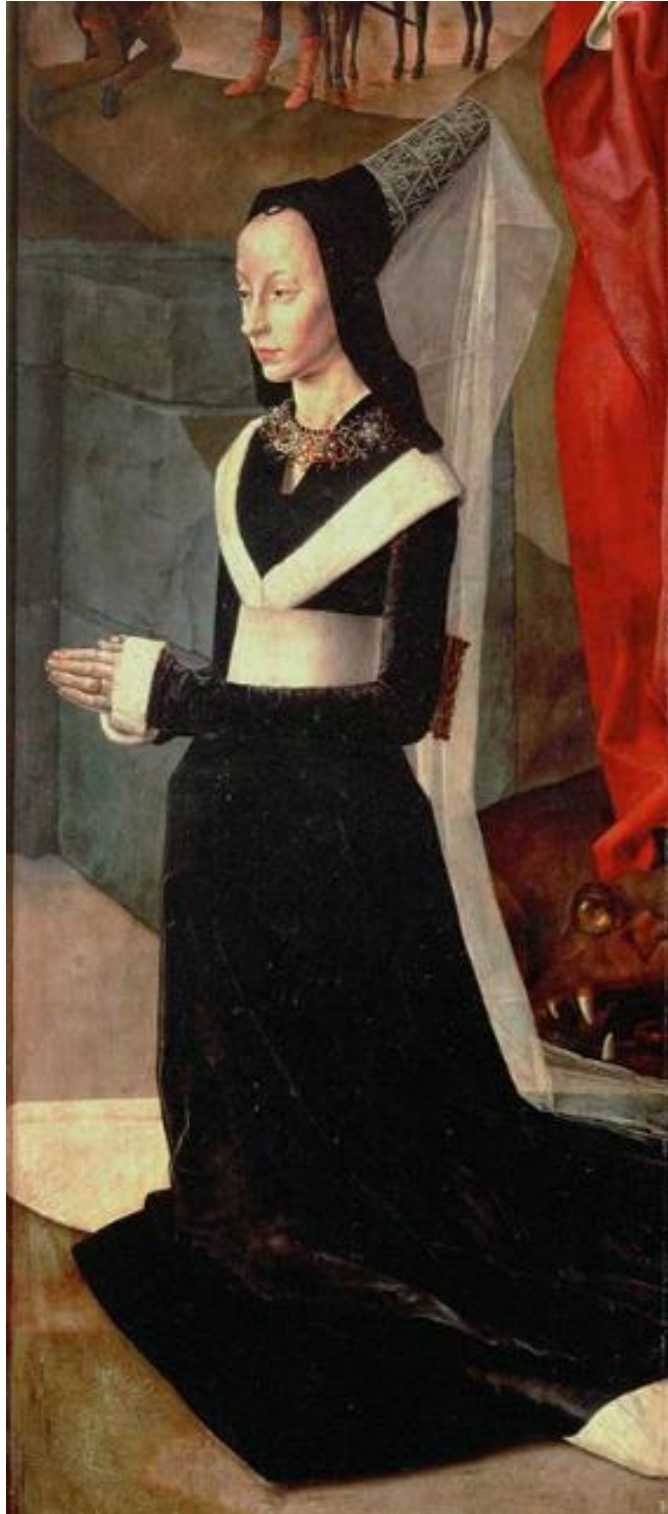
Figure 4 Hugo van der Goes, Detail of Portinari Altarpiece , 1473-1478 Oil on wood Galleria degli Uffizi, Florence http://www.wga.hu/frames-e.html?html/g/goes/portinar/index.html