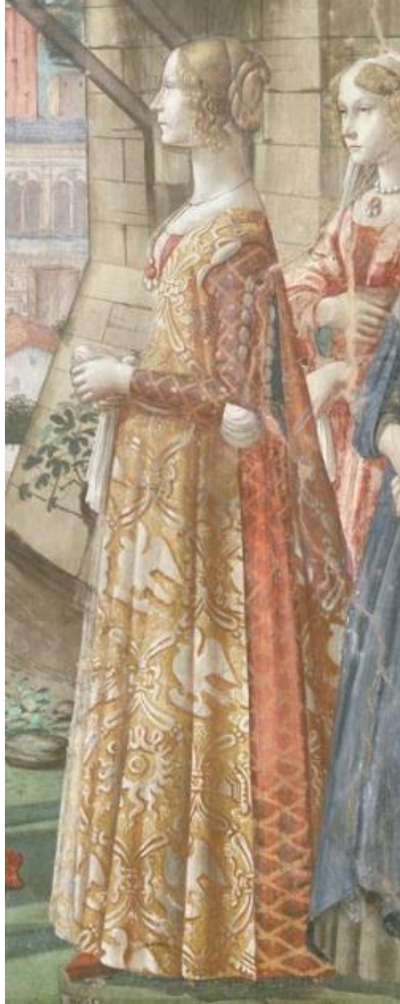
Figure 3 Domenico Ghirlandaio, Detail of The Visitation , 1486-1490 Fresco Santa Maria Novella, Florence http://www.wga.hu/frames-e.html?/html/g/ghirland/domenico/6tornab/62tornab/2visita.html